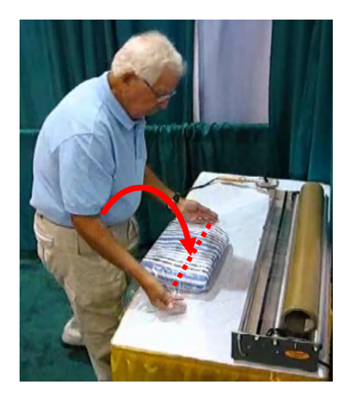
3. Bring rear up and over the back of the bundle covering roughly 1/2 - 3/4 of the top of the bundle