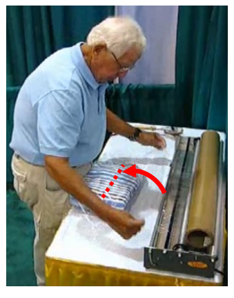
4. Pull front of film downward across heat rod to cut, then over at least 2" of the top of rear film layer