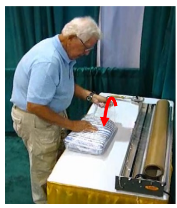
6. Repeat using opposite hands to finish left side of bundle