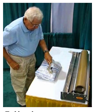
7. Use iron as necessary to tack seal bundle seams. Iron should be hot enough to weld film to itself without melting holes in film.