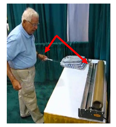
1. Pull film length roughly 2x the width of the bundle. Lay gently and smoothly across cutting rod onto work area. Do not cut film from roll.

The following is a simple method to wrap bundles. There is no incorrect method, technique will evolve as one gains experience. As long as the final product is an attractive sealed bundle you are wrapping correctly!