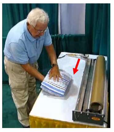
2. Place bundle <u>face</u> down on top of film.