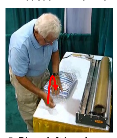
5. Place left hand on top right side edge of bundle to hold secure. Use right hand to tuck and pull right side up and over top of bundle