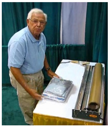
8. Flip over for presentation or storage